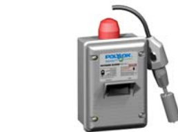
Outdoor SmartFilter® Alarm Polylok, Zabel & Best filters accept the SmartFilter® switch and alarm.