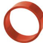
Spacer Bushing 4" SCHD 40 to 110mm Pipe