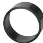
Spacer Bushing 4" SCHD 40 to SDR 35